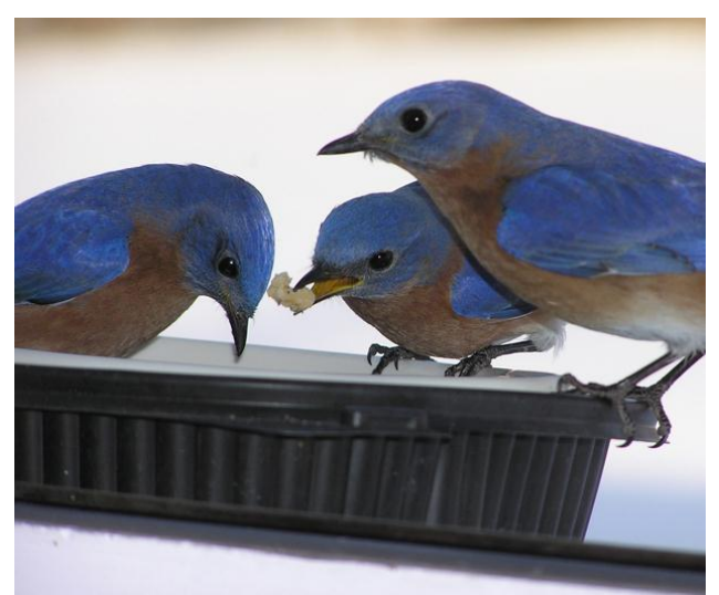
Bluebirds eating suet mix at winter feeding station

10523 Walter Thompson Dr. Vienna, VA 22181